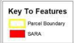
Sensitive Aquifer Recharge Areas (SARA)